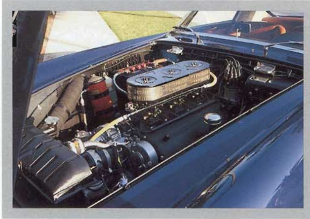
Marcel Massini Photograph

THE HISTORY OF NEW BRITAIN RESEARCH OF HOLLAND