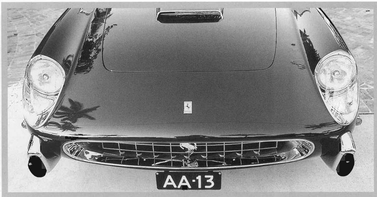
"AA-13" was the traditional Dutch diplomatic plate belonging solely to HRH Prince Bernhard. Here on 250 GT Pinin Farina Speciale, s/n 0725 GT.