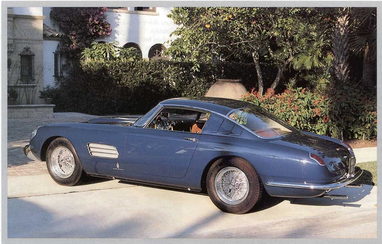
Marcel Massini Photograph