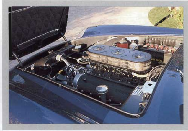
Marcel Massini Photograph