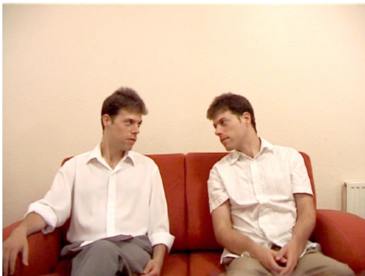
Image 2: A Poet in a Conversation with his own Creative Self. Still Image from the Film Interview with Authorial-Self , 2007. www.youtube.com/gldek

act of writing poetry is not merely 'unconscious/creative' but also a conscious intellectual formulation and choice of words. Poetic writing contains rational acts of observation of the poet's emotional experience, and the adaptation of words to describe it. The poet critically chooses words to fit and describe his emotion. This involves linguistic choices and the selection and analysis of non-verbal experiences, in a process which is intellectual. The short film Interview with authorial – Self (2007, http://www.youtube.com/watch?v=QKzjLwrsDQ4 ) portrays a conversation between a poet and his own source of creativity, discussing the stages of translating inspiration to the physicality of words.