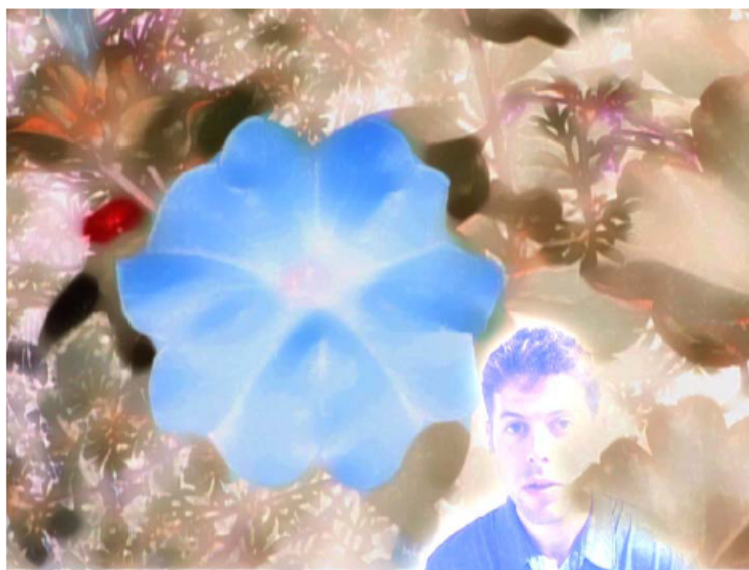
Image 5: Experiences of ‘Opening Up’ to Sources of Poetic Inspirations. Still Image from the Film Unfolding Hearts , 2006. www.youtube.com/gldek

([1781] 1964: 27) sees as a ‘larger’ source of information. In the very activity of writing poetry one may open up to a wider flow of creativity and transform not only oneself but perhaps the reader as well. The short film Unfolding Hearts (2006, http://www.youtube.com/watch?v=zw2bd1ro8nw ) tells the true story of ‘opening up’ to a source of infinite poetic knowledge that rushes through the poet. Being in awe to that source, as experienced by the poet, poses the question of the nature of that source. Recent research on the English Romantic seems to address this question.