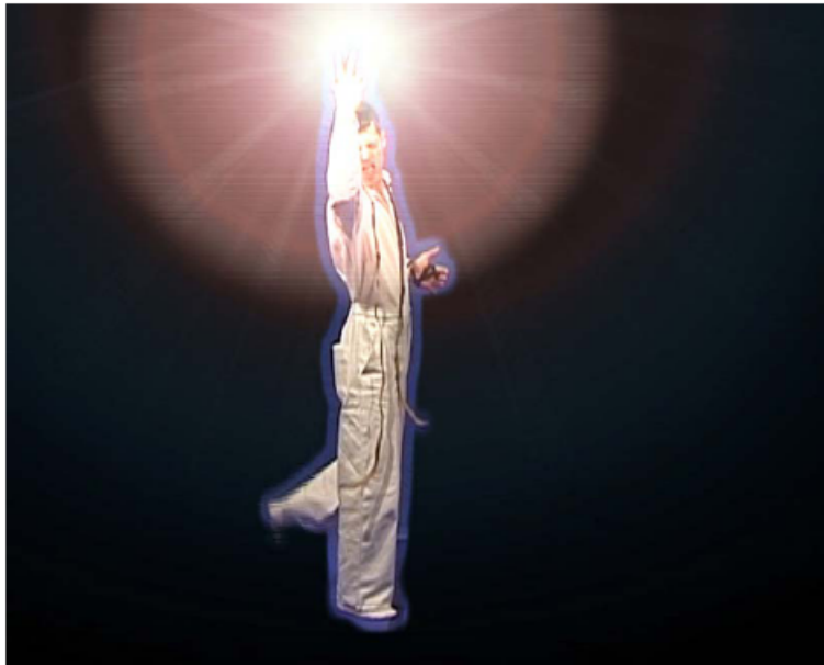
Image 1: Light 'Passes' through the Poet. Still Image from the Film Quantum Words , 2006. www.youtube.com/gldek

Cassirer (1946: 44) explains that language and the basic forms of community are originally tied up with mythico-religious conceptions. As verbal structures are also symbols endowed with mythical powers, the word assumes a sort of primary force. In all mythical cosmologies as far back as they can be traced, this supreme position of the word can be found (Cassirer, 1946: 45). Poets seem to articulate such primary force through words, yet when it comes to poetic experience, poets have been pointed out as using creative forms that are separated from their conscious intelligence in the act of writing (Skelton, 1978: 1). The poet is seen as having certain moments of creativity, characterized by denial of objectivity and intellect. However, my research shows that the actual