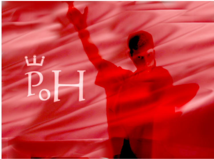
Image 3: Inner State and Outer State of the Poet. Promotion Poster for the Film The Prince of Hampshire , 2006. www.youtube.com/gldek

These visual motifs were tested in the film Explorers of the Heart (2007, http://www.youtube.com/watch?v=z3rtbs0Xbds ),